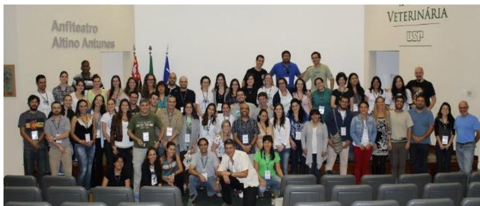
I Biennial Conference of the WDA Latin America Section, Sao Paulo, Brazil, 2013.

We hope you have enjoyed your reading. Suggestions and comments are always welcome and appreciated. Please feel free to contact us at: wda.latinamerica.newsletter@gmail.com . For more information about our section please visit: http://www.wdalatinoamerica.org/?page_id=2 .